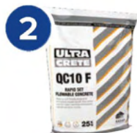
2 QC10 F Rapid set Flowable Concrete