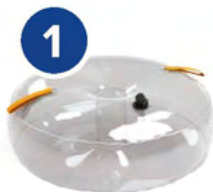
1 Mortar Buoy® Inflatable Form