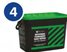
4 Instarmac Permanent Road Repair® Permanent Cold Asphalt