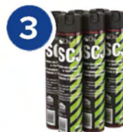
3 SCJ SCJ Tack Coat and Joint Sealer