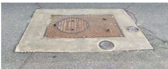
Manhole restoration to surface