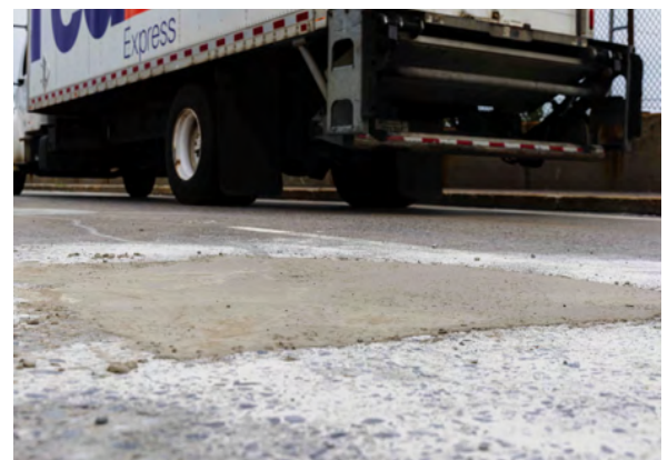
New York State DOT bridge deck repairs